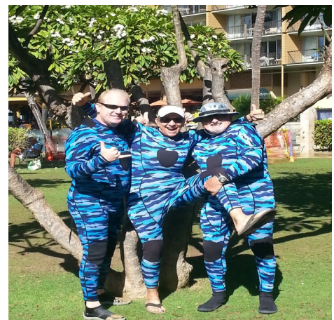
SCUBA LUV DIVE TEAM

TO SEE MORE REPORTS, GO TO: www.scubaluvmaui.com